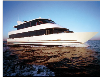
A great big "Thank You" to Queen's Landing for donating its beautiful Lady of the Lake.

For the third straight year, LNWC's loyal members and friends pitched in to support wildlife habitat enhancement projects on our beloved Lake Norman and beyond. Despite continuing financial challenges faced by many businesses and households, the third annual Lake Norman Wildlife Cruise raised more than $4,000, topping our 2009 cruise.